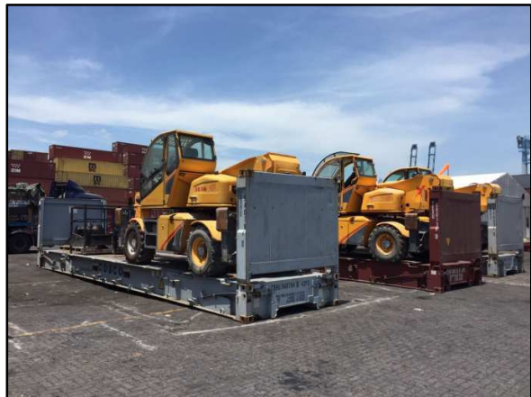
Deici excavators loaded at Port Klang, awaiting lashing.

Having completed the Ulu Jelai HEP project, CNC worked on demobilizing construction equipment out of jobsite which was mostly temporary imported. In Q1 & Q2 2016, CNC shipped 55 special containers consisting of numerous excavators, rock drilling vehicles, dump trucks, dozers, and rough terrain cranes to various locations in Europe, South America & Africa.