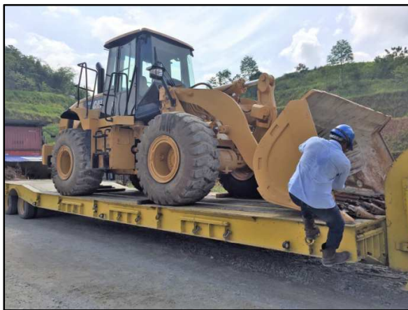
Caterpillar excavator after being rolled-on at Ulu Jelai HEP jobsite.