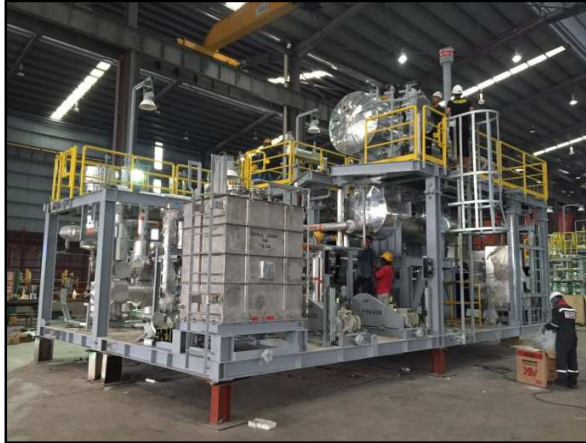
Survey of Glycol Reboiler Skid at Gebeng, Kuantan fabrication shop.