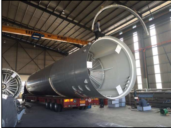
Loading at origin fabshop was done via overhead gantry cranes in tandem.