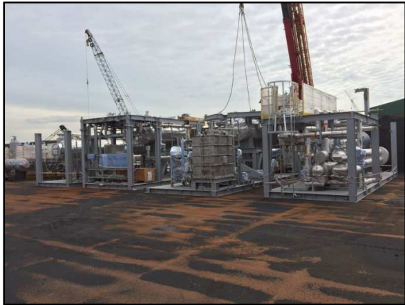
Dehydration units loaded onto 280 feet barge.