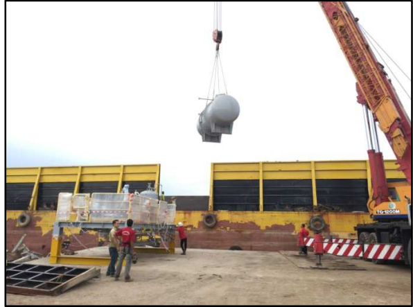
Loading of Glycol Slump Drum onto barge via 150 ton mobile crane.