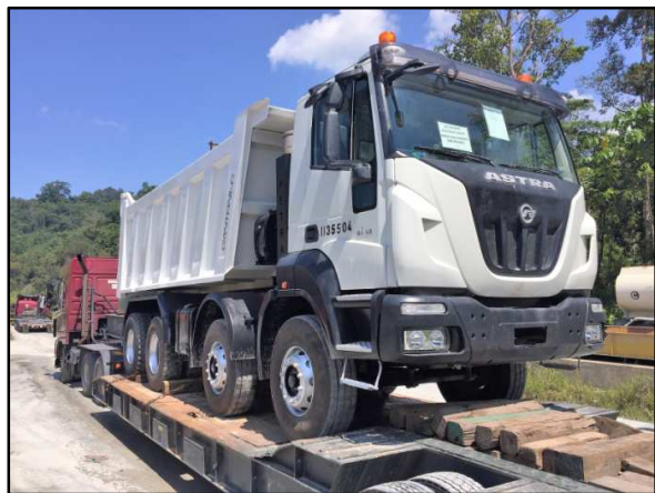
Astra dump truck loaded on lowbed trailer at jobsite.