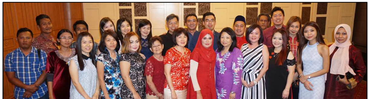
Staff & family of CNC striking a pose for our annual company dinner last January 2017.