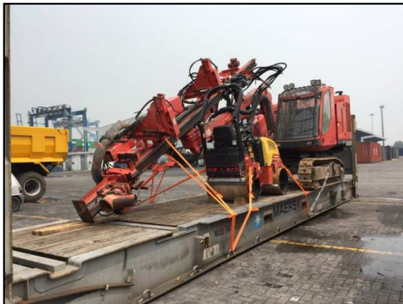
Jumbo Tamrock, stuffed and lashed on 40'FR at Port Klang.