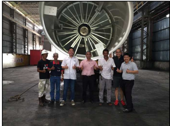
CNC & trucking team upon completing loading of last silo at BKH.