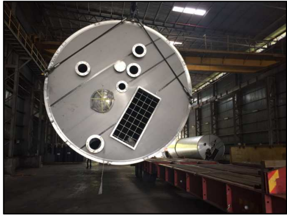
Transloading at Bukit Kayu Hitam (Malaysia – Thailand border).