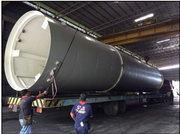
Transfer of Storage Silo onto Thai registered flat-bed truck.