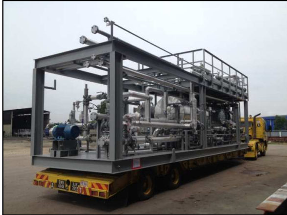
Surge vessel loaded on lowbed at shipper's premise.