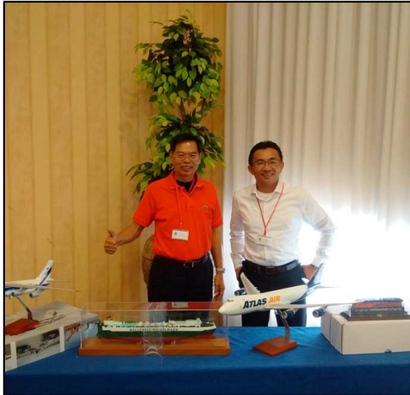
WWPC at Fuengirola, Spain – May, 2015.