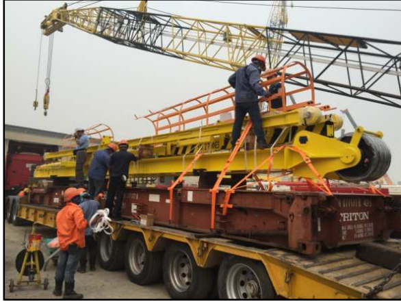
Mast assembly being stuffed at shipper's premise.