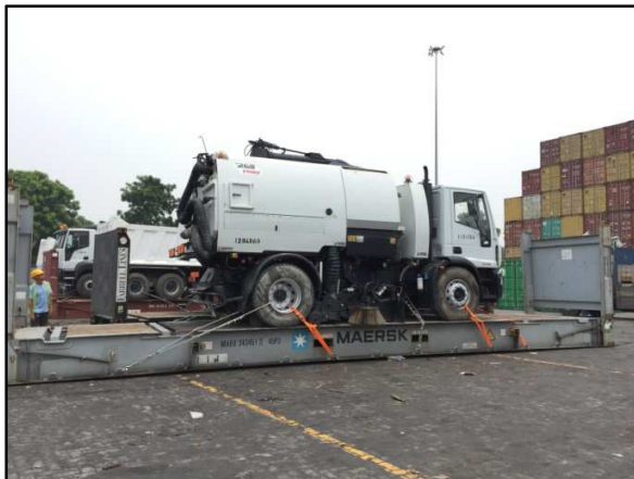
Iveco Astra heavy duty dump trucks lashed and secured at Port Klang.