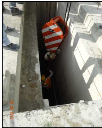
Water Gate carefully being hooked-on.