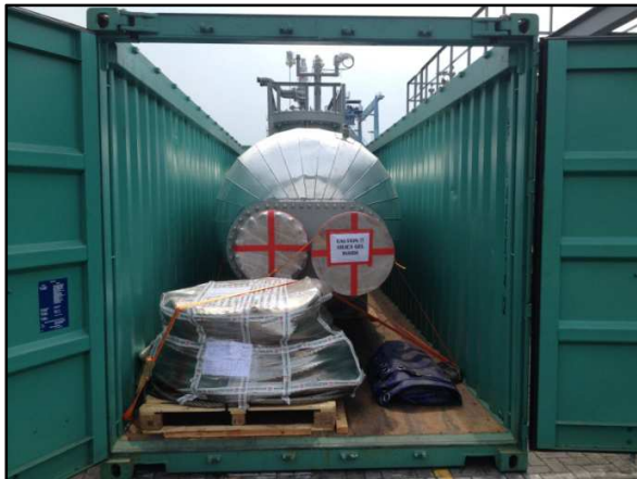
Stuffing of smaller pressure vessels and accessories into OT container.