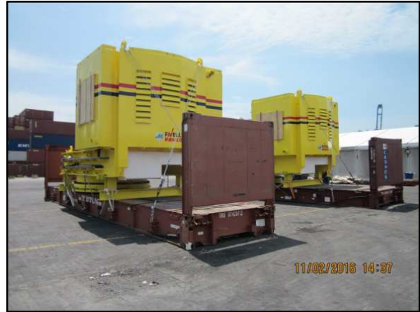
Machinery Decks after being loaded and secured onto Flat-Racks.