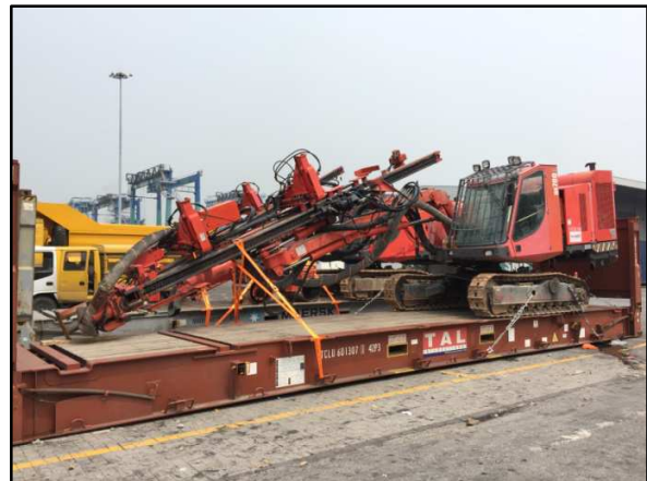
Sandvik Tamrock jumbo on Flat-Racks prior returning to Italy.

CNC supplied a 300 crane hydraulic crane for lifting Water Gate to install in Ulu Jelai Dam. The crane was further utilized for installation of Penstock Pipe line on the Dam.