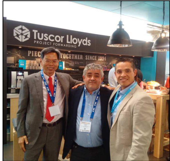
Breakbulk Antwerp at Tuscor Lloyd's booth – May, 2015.