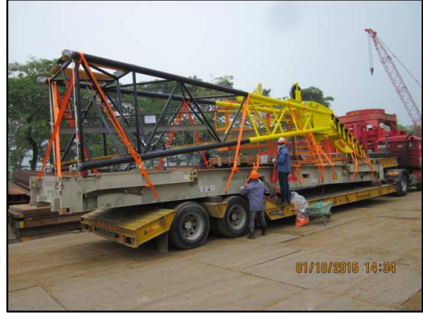
Boom top after lashed at shipper's premise.