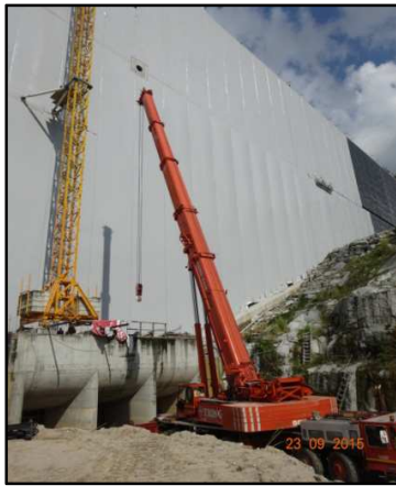
300-ton Demag crane positioned at site.