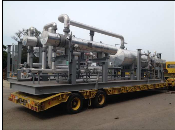
Condensate pump skid before departing to Port Klang.