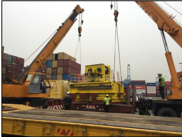
Tandem lift of Machinery Deck at Port Klang.