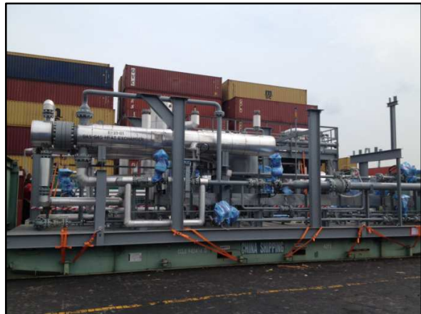
Gas heat exchanger skid after stuffing into 40'FR container.

Scope of Work : Door to Door Port of Loading : Port Klang, Malaysia Port of Discharge : Abu Dhabi, UAE Cargo : Process System Skids Total Containers : 7x40'FR, 2x40'OT & 4x40'HC Total Gross Weight : Approx. 100 M/Tons