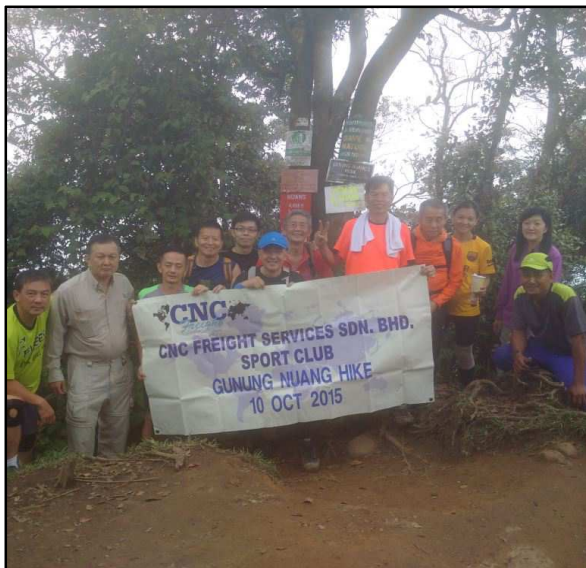
Our Sports Club up at the peak of Gunung Nuang – October, 2015.